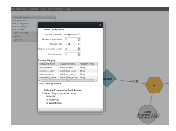
Fig. 3: Selection of algorithms.

measures (incl. Levenshtein, Trigrams, Cosine) as well as operators (incl. AND, OR, MAX, MIN) to combine these metrics to a single specification manually (see Figure 2). The user can also choose the Learn metric button instead, which allows the user to select between several machine-learning algorithms for link specification learning including EAGLE [6] and its extensions in COALA [7] (Figure 3). After choosing these algorithms, the user is presented the most informative positive and negative examples and can choose whether they are matches or non-matches. SAIM supports the user in this process by allowing him to view the values of the properties of the resources that are part of the match or to dereference their URIs. SAIM also enables lay users to create link specification by offering a self-configuration mode. In the corresponding window (see Figure 4), SAIM allows the user to choose which algorithm to use and whether the specification should be tuned towards precision or recall (the default setting being that both are equally important). Once the user has selected a configuration, SAIM runs unsupervised machine-learning algorithms based on EAGLE or RAVEN and returns the specification that maximize a selected pseudo-F-measure. The specification shown in Figure 2 was learned fully automatically by the unsupervised version EAGLE.